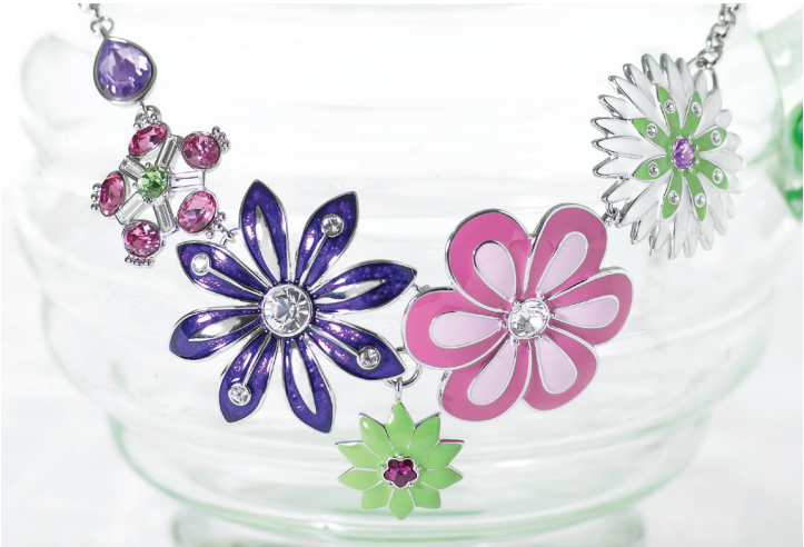
GARDEN JEWELS NECKLACE