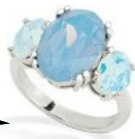
Blue Belle Ring

Shop with me 24/7 on my website! Be sure to check out our online exclusives!