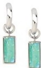
Aqua Blue Earrings