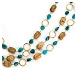
Round Up Necklace