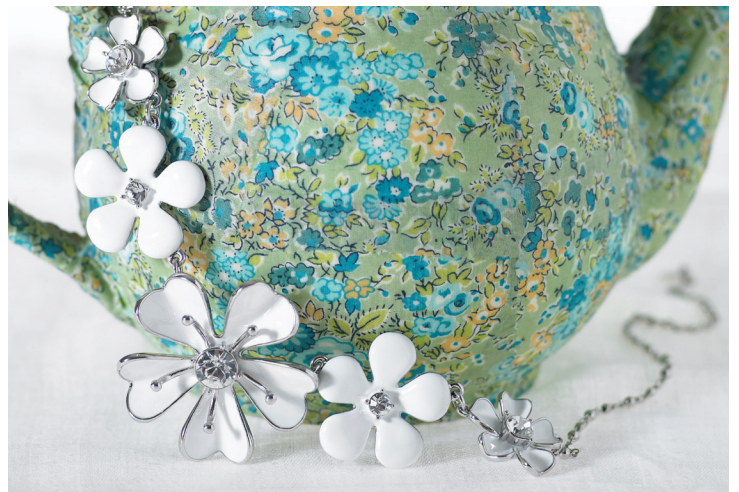
SUMMER WILDFLOWER NECKLACE

*Party must be held and closed between May 1-July 31 at 11:59 pm PST and must be a minimum of $300 in commissionable sales. This Host Special is non-commissionable and is in addition to our Host Reward Program and as such, Host Dollars and Host half-price Rewards may not be used in combination with the $49 discounted item. Host may purchase one of the above necklaces per party.