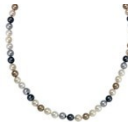
Prized Pearls Necklace

I see when men love women. They give them but a little of their lives. But women when they love give everything. —Oscar Wilde